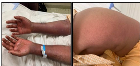
Figure 1. Pictures of arms and back of the patient showing diffuse erythematous maculo-papular rash in the patient with TA-GvHD.

can be prevented by inactivating transfused lymphocytes by exposing all cellular blood products to gamma irradiation or avoiding directed donations.[19] Leucodepletion of cellular blood products is not a suitable alternative for irradiation.